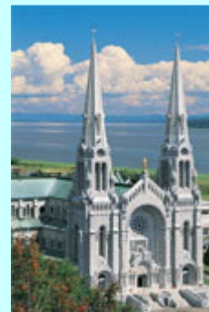
St. Anne de Beaupre