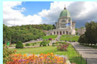
St. Joseph's Oratory, Montreal